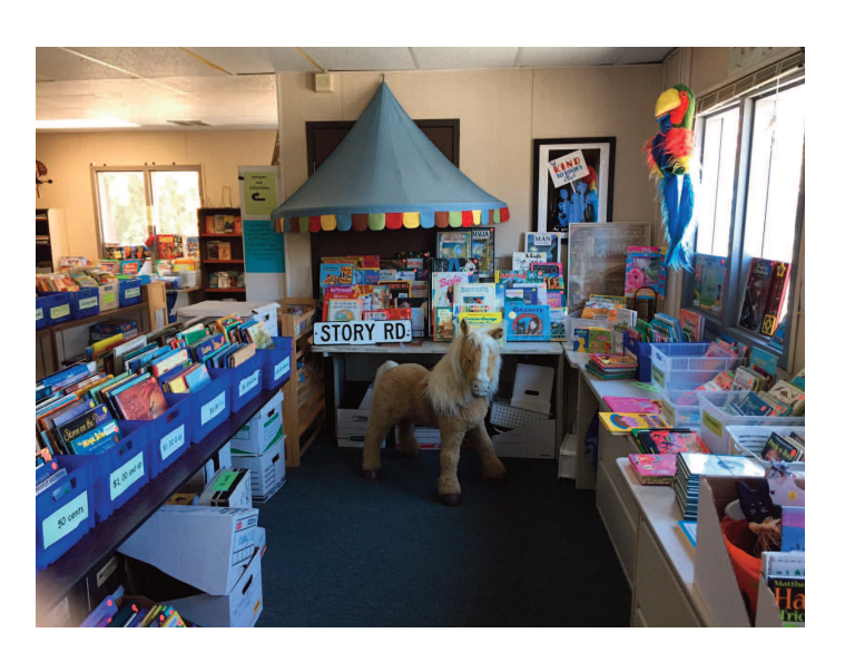
The Children's Book Sale Room in the southwest corner of Cubberley Community Center