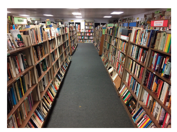
Ready for the Sale