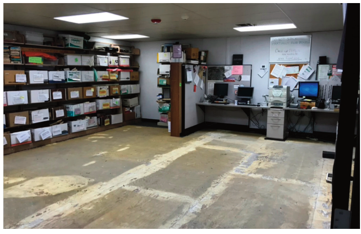
FOPAL's sorting room after removal of contaminated carpet.