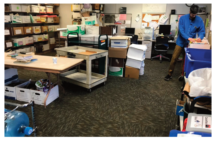
A nicer looking sorting room with new carpet.